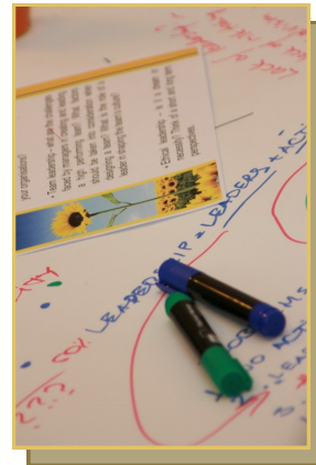
Workshop during the BMDA Conference