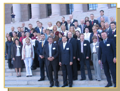
Moment of the previous BMDA conference

This year the 10th BMDA Conference “Winning strategies in Challenging times” will have the RESEARCH PART!