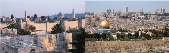
Training dates and location: February 24-26, 2016, Tel Aviv, Israel

Tested during more than 40 years of successful implementation within various organizations & business companies all around the World!