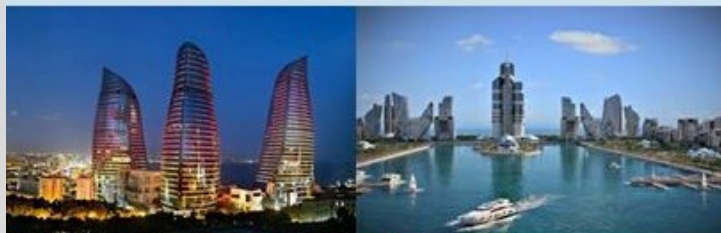
Training dates and location: March 2 – 4, 2016, Baku, Azerbaijan

Tested during more than 40 years of successful implementation within various organizations & business companies all around the World!