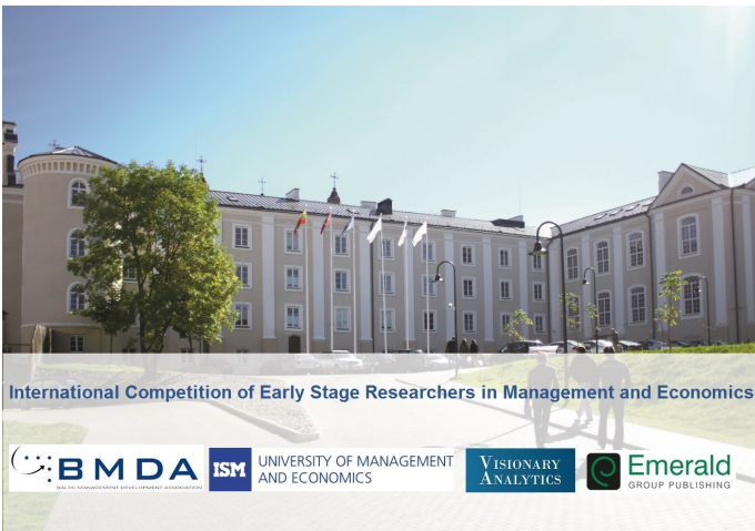
International Competition of Early Stage Researchers in Management and Economics